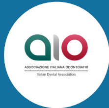
Italy – AIO