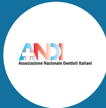
Italy – ANDI